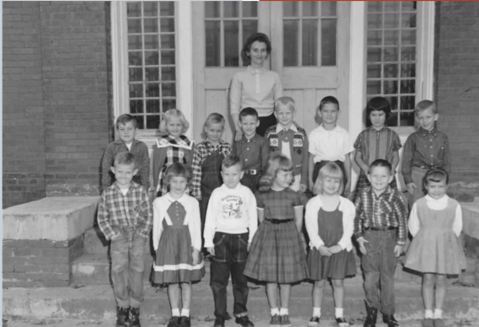
1st Grade 1959-60